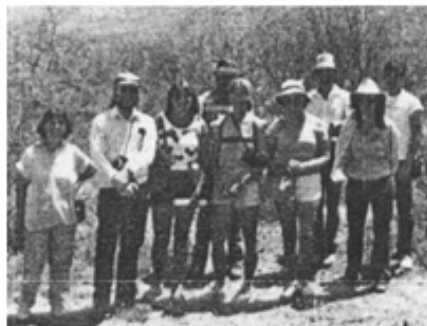
Institute Charter Members Tour the Romero Ruin Ballcourt. May 1986.

Roughly eight dollars of your dues cover the costs of the newsletter and membership activities. The remainder goes for direct support of special local archaeology or educational programs undertaken by Archaeology in Tucson . We urge you to look us over carefully, and then select the highest membership category you feel comfortable with.